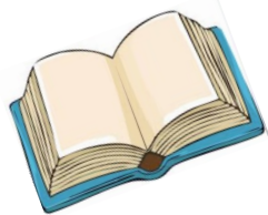
Class 1 Reception

We challenged the children to decorate a box and to hide clues to a mystery book inside for World Book Day this year. As usual, everyone knocked it out of the park - they were brilliant, as you'll see below!